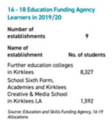
Kirklees Factsheets 2020

The pattern of post-16 provision in Kirklees therefore differs from much of that in the rest of the country in that a much higher proportion of students are in colleges rather than schools.